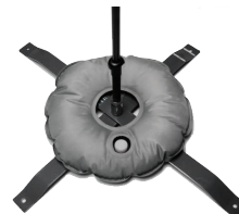
Water bag (+ Cross stand)